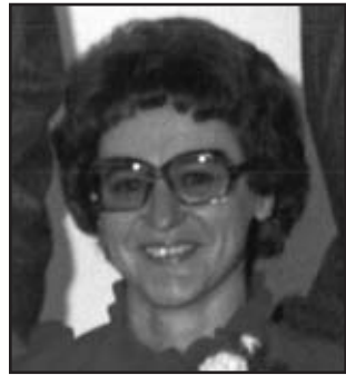
Happy Birthday!! Mom & Grandma

With Love from your children and grandchildren